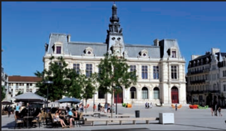
Poitiers, City Hall

Programme of this event is shown overleaf. See the back page for booking your place to join us in Poitiers.